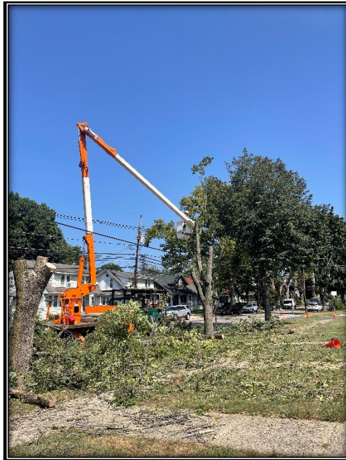
Figure:1 Trimming and removal of trees that encroach onto roadway.

Monday, September 09, 2024, to Friday, September 23, 2024