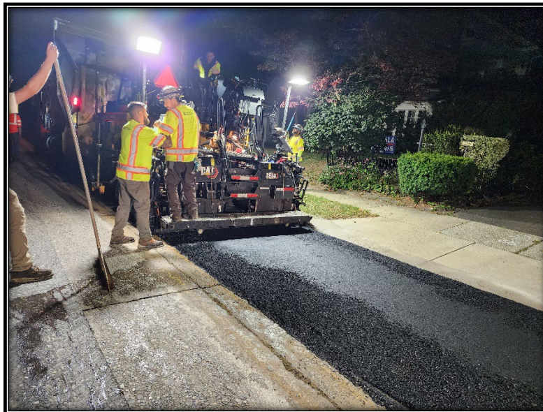
Figure 3: Milling and temporary paving operations of East Bound shoulder between East Lake Drive to West Atlantic Ave.