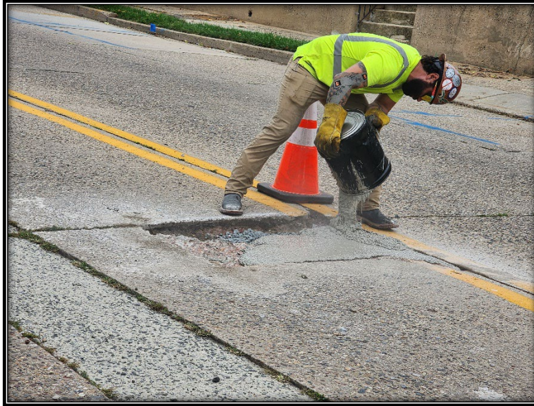
Figure 2: Partial depth repairs of deteriorating/spalling concrete pavement at various locations.

Department of Public Works Charles J. DePalma Complex 2311 Egg Harbor Road Lindenwold, NJ 08021 phone 856.566.2980 fax 856.566.2988 highway@camdencounty.com CamdenCounty.com