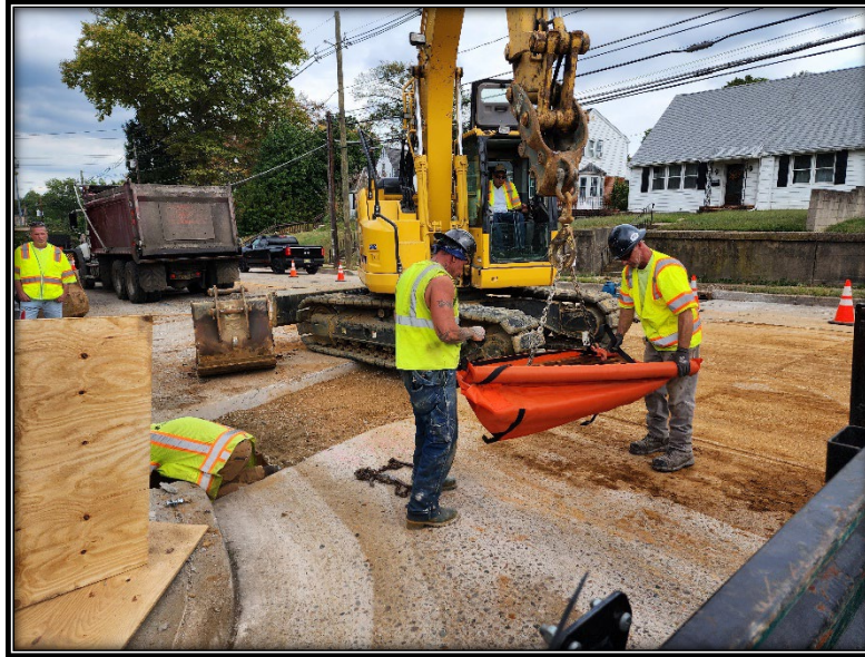
Figure 6: Installed inlet filter with new grate.

Department of Public Works Charles J. DePalma Complex 2311 Egg Harbor Road Lindenwold, NJ 08021 phone 856.566.2980 fax 856.566.2988 highway@camdencounty.com CamdenCounty.com